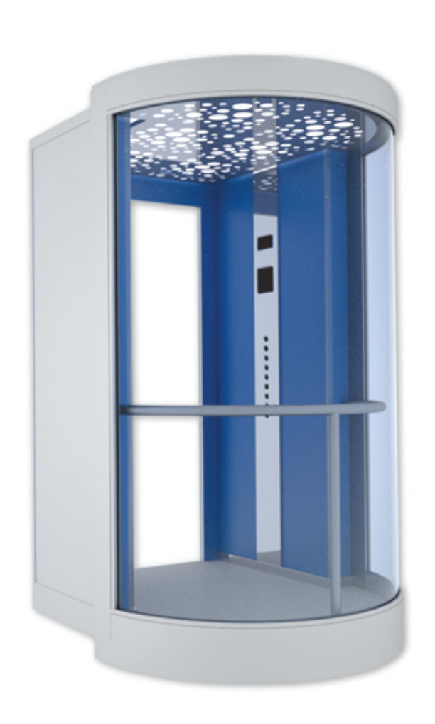
Swing Doors Telescopic Doors